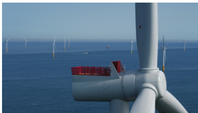
Galloper Offshore Wind Farm

The Project is being proposed by Five Estuaries Offshore Wind Farm Limited. The Five Estuaries Project partners are; RWE (25%), a Macquarie-led consortium (25%), Siemens' financing arm, Siemens Financial Services (25%), ESB (12.5%) and Sumitomo Corporation (12.5%). RWE is leading the development of the Project on behalf of the project partners.